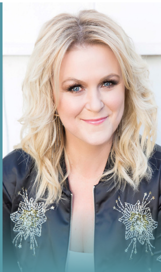
CAROLYN DAWN JOHNSON