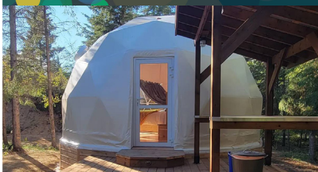
Elk Island Retreat

Make holiday shopping a breeze - bid in our online auction! Items include: