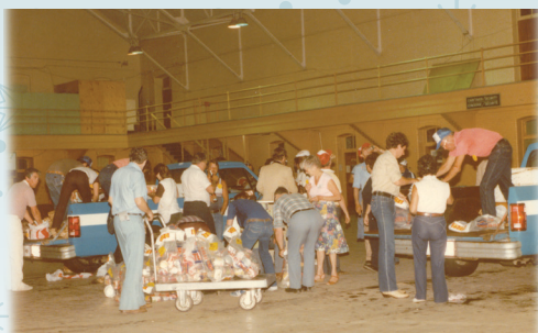
Prince of Whales Armory, 1984